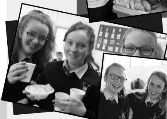
Above and Right: Some first year girls soaking up the atmosphere of 'Healthy Living Week'.