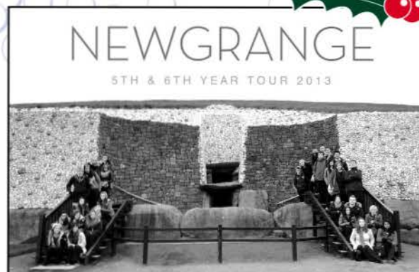
Above: Art Trip to Newgrange