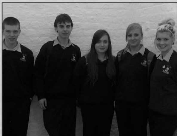
Above: A group of 6th year History students at Kilmainham Gaol