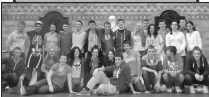
Above: Students outside the Natural History Museum

Arriving at the school at 2am isn't everybody's idea of fun but for 24 students on the 3rd of October, it meant a packed trip to London. With an early start, we arrived in London at 9.30am. Making our way to a Forensics workshop in the L'Oreal Young Scientist Centre at the Royal Institute where we experienced real world crime scene analysis using DNA.