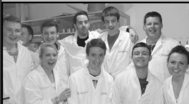
Below: Students in the L'Oreal Young Scientist Centre