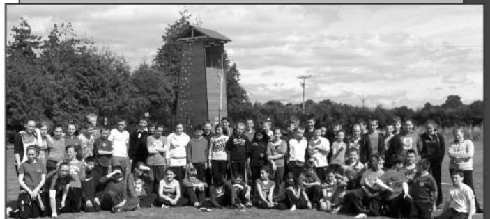
Above: A group of first years at the Outdoor Education Centre in Birr

Starting secondary school was a change, Eating in the canteen was a little strange, Couldn't find my way around for a while, On the first day I would have ran a mile! Not that I was scared, it was so Different, And the five minutes early was very important, Running and racing from class to class, Yeah! I didn't want to be last.