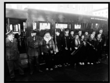
Pictured are the LC1A class outside the iconic GPO in Dublin city.