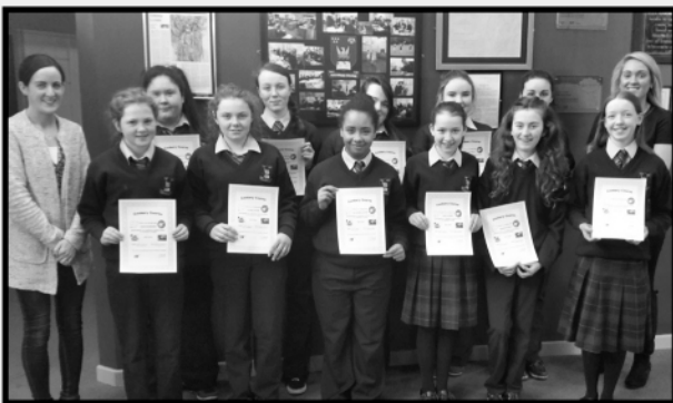
After School Cookery Club